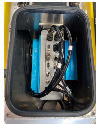
Flexible Multibeam System Integration

Seafloor Systems, Incorporated | 4415 Commodity Way | Shingle Springs, CA 95682 | USA